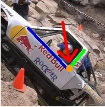
Blue=Doorbar Green=B-pillar Orange=Doorbar Junction to the B-pillar Red=Arrow pointing to the topic of Interest.